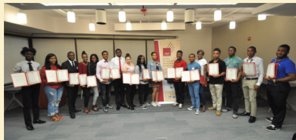
2018 KSEF Scholarship Recipients

You can contribute to the Named Endowed Scholarship Program in two ways: (1) A single lump-sum payment of the total amount. (Increments of $5,000) (2) A minimum initial down payment of at least one third of $5,000 with the outstanding balance being paid within three years of the initial contribution.